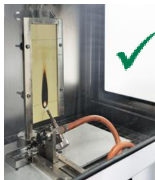
Flame retardant according to DIN 53 438