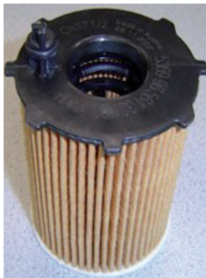
Figure 1: MAHLE OX 171/2 D Eco

For years, MAHLE has been supplying the OX 171/2 D Eco and the OX 171/16 D Eco—which is new to the aftermarket—for series production. These oil filter inserts are used in numerous models with 1.4 L and 1.6 L diesel engines (OX 171/2) from manufacturers including Citroën, Peugeot, Mazda, and Volvo, as well as in the Fiat 500 Twin Air (OX 171/16). They are equipped with the pin patented by MAHLE and are cut exactly to match the geometry of the oil filter housing.