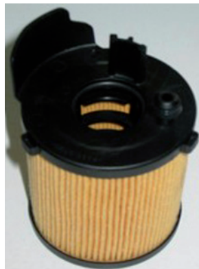
Figure 2: Competitor's replica

Important when replacing the filter inserts: you must fit either an OX 171/2 D Eco or OX 171/16 D Eco from MAHLE Original or Knecht, because only these will satisfy the high demands of original equipment (pin and exact fit).