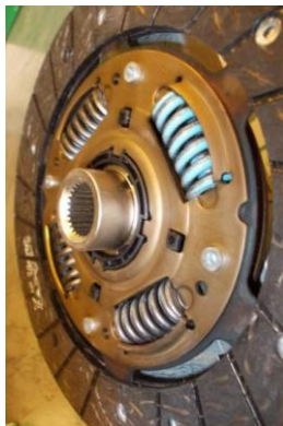
Flywheel side of disk kit 826818