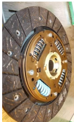
Gearbox side of disk kit 826818